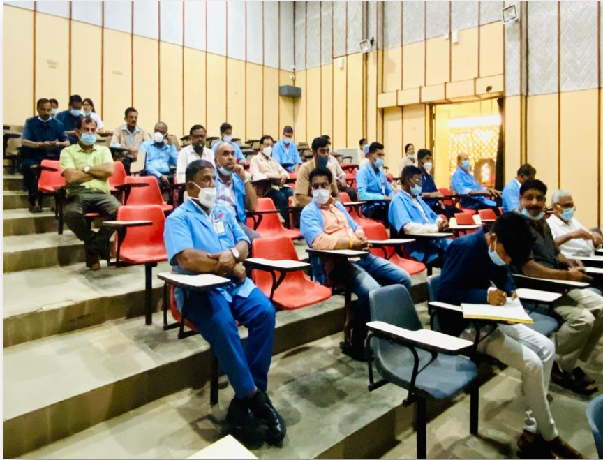
Participants listening to lectures