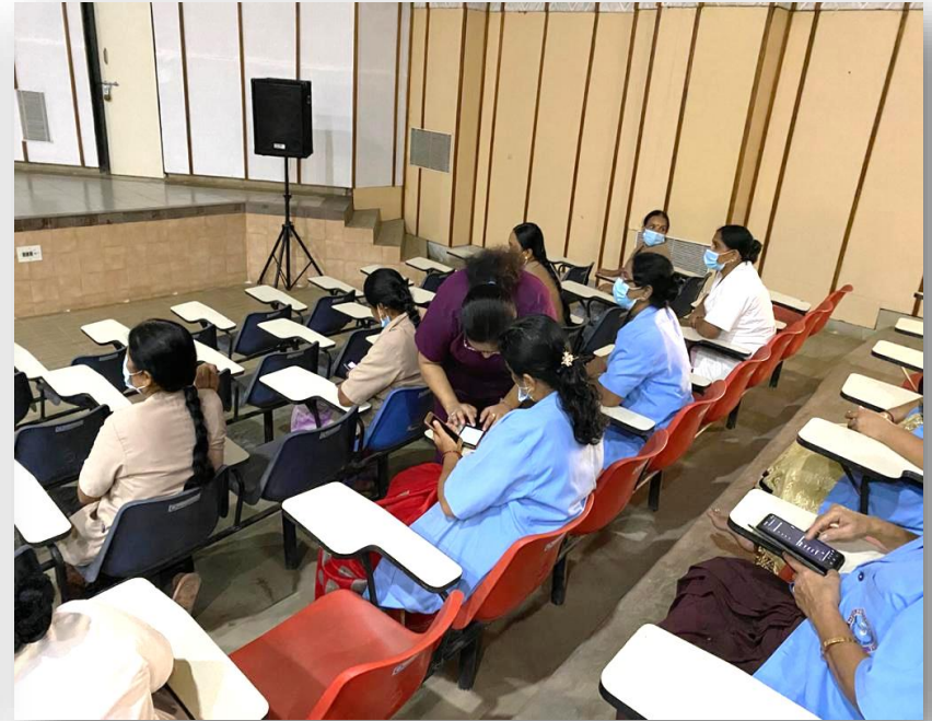
Participants actively participating in the program by responding to activity questionnaires