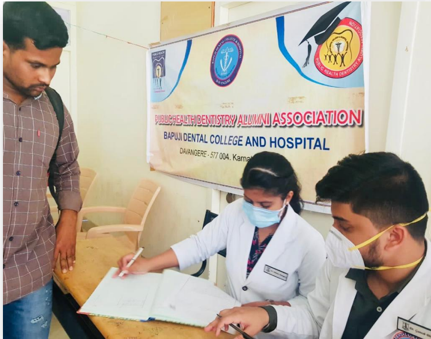
Registration of participants to screening program