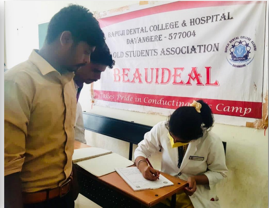
Allotment of referral cards